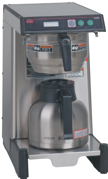
Model WAVE-APS with Economy 1.9L Thermal Carafe (thermal carafe sold separately) Dimensions: 16.94-18.69" H x 9.71 W x 17.24"D (43cm H x 22.2cm W x 43.8cm D)

Low-profile brewer featuring SmartWAVE technology, simple operation, and flexible server options