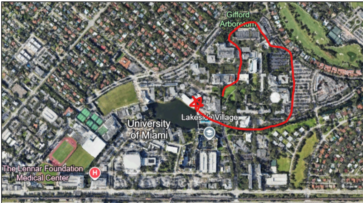
FIGURE 1: OUTLINE OF WALKING ROUTE